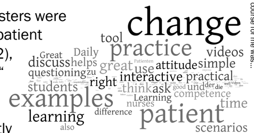
Fig.3: A word cloud from all free text supplementary notes to the question about „The most essential yield of the course for me was...“

Free text notes were summarized to 17 clusters. The most frequent clusters were (a) „self reflection“ (137/562), (b) „practical examples“ (130/562), (c) „patient motivation“ (79/562), (d) „videos“ (77/562), (e) „interactivity“ (69/562), (f) „simple and practical use“ (64/562) and (g) „great tool for students“ (62/562). MS and PST mentioned the didactics of the course (b, d, e, g) more than GPs . Whereas GPs pointed out self reflection (a) and (h) „reinforcement of my current way of communication“ more frequently than the MS and PST .